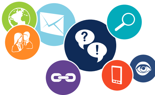
Connection points between support channels (Figure 1)

Recently, however, we have seen a significant shift away from this traditional model of support. Sophisticated companies, following the trend in the consumer space, have embraced multi-channel support and have started to introduce options like Live Chat and walk-up support kiosks into their existing frameworks. In addition, companies have been revamping their self-service portals with an emphasis on the end-user experience. Whereas self-service portals used to be characterized by poor navigation and technology-heavy jargon, they now are becoming known for their intuitive interfaces and user-friendly tools. By improving the end-user experience, these companies have seen an increase in support traffic through this channel.